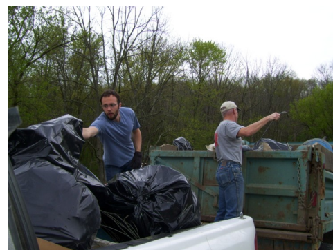
Staff and volunteers help load the dump truck with trash at Stream Sweep.

The U.S. Department of Agriculture (USDA) prohibits discrimination in all its programs and activities on the basis of race, color, national origin, sex, religion, age, disability, political beliefs, sexual orientation, and marital or family status. (Not all prohibited bases apply to all programs.) Persons with disabilities who require alternative means for communication of program information (Braille, large print, audiotape, etc.) should contact USDA's TARGET Center at 202-720-2600 (voice and TDD). To file a complaint of discrimination write USDA, Director, Office of Civil Rights, Room 326-W, Whitten Building, 14th and Independence Avenue, SW, Washington, DC 20250-9410 or call 202-720-5964 (voice or TDD). USDA is an equal opportunity provider and employer.