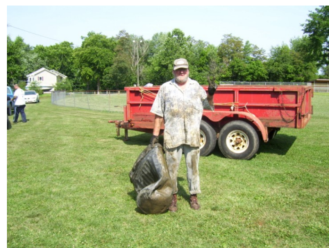
A River Sweep volunteer shows off his find.

We also coordinated 3 sites for the Ohio River Sweep on June 16th. Between Racine, Pomeroy, and Syracuse we had 154 volunteers! This is more volunteers than we have ever had before! Together, they collected an estimated 2.5 tons of trash along the Ohio River. These volunteers also received free pizza, t-shirts, and drinks after the event. We were pretty close to running out of pizza, but we made it work! Sixty-two Girl Scouts