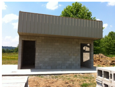
Left. The new restroom facilities, which were completed at the end of June!

In addition, restroom facilities were recently finished on the property. Funds for these facilities were provided for by the Meigs County Grants Office. These restrooms will be perfect and very helpful for Watershed Camps and educational field trips held at the Conservation Area!