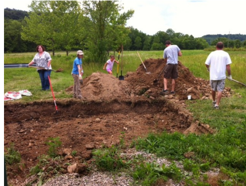
Left. Staff and volunteers help to fill the rain garden in with soil, sand, and compost.

Rain gardens are mainly used in storm-water management, where rain is collected from impervious surfaces such as roads. These gardens allows the rain to slowly filter through the soils instead of running off the land and creating erosion. Rain gardens also help to filter out any pollutants from the water before it enters into a stream. In our case, the down-spout from the shelterhouse feeds directly into the rain garden. The rain soaks down into the garden, providing the plants with water. After filtering through the soil, the excess rain will then enter into a tributary to Little Leading Creek. All of the plants that we planted in our rain garden were recommended for storm water management by the Ohio State Extension Office and are either native or naturalized, non-invasive species.