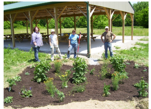
Right. Staff pose with the finished product, after several days of hard labor

The rain garden will also be used as an educational tool for school groups, and we hope to get a descriptive sign out there soon. Stop by and check out the beautiful plants!