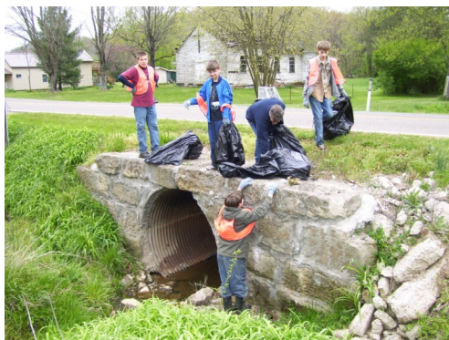
Boy Scouts clean up a stream at the 2012 Leading Creek Stream Sweep.

A huge thank you goes out to all of our volunteers and our partners and donors, including but not limited to: ORSANCO, Powell's Food Fair, OSU Extension Office, Veterans of Foreign Wars Stewart Johnson Post 9926, Pepsi, Jaymar, Inc., Home National Bank, Farmer's Bank, Leading Creek Conservancy, and Hill's Sunoco.