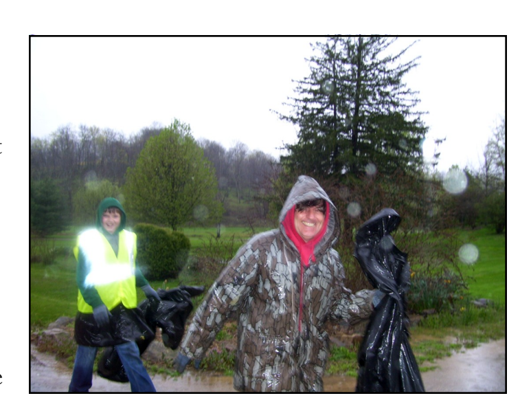
Having fun and cleaning up streams, even in the rain!

The event is sponsored by the Meigs SWCD, Rutland Township Board of Trustees, and the Meigs County Transfer Station.