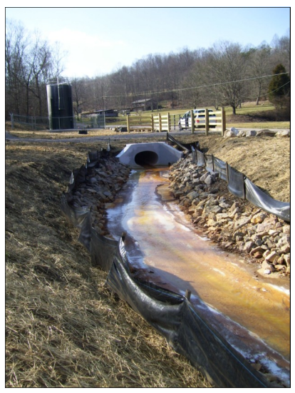
Treated water leaving the Thomas Fork Doser, before entering the creek.

At a location directly downstream of the doser, we actually found a baby dragonfly in the stream! The water there was previously so bad that nothing could live there. Hopefully we will soon be seeing other critters move in!